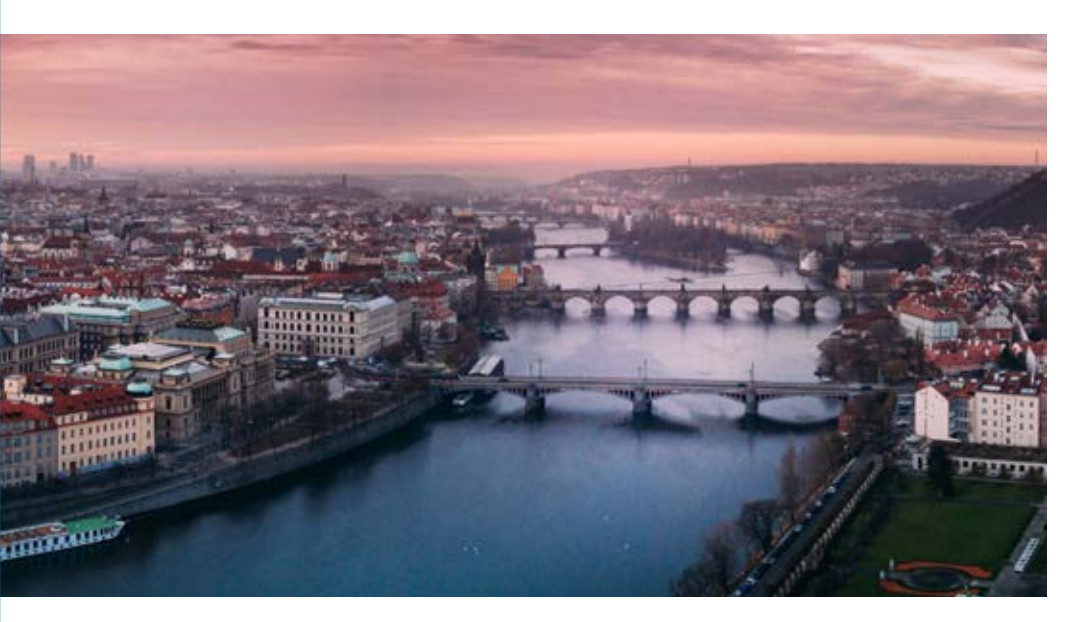
The Czech Republic lies right in THE HEART OF EUROPE and, with just 10 million inhabitants, features 12 UNESCO World Heritage sites, including the historical center of its capital Prague.